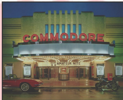
Movie at the historic Commodore