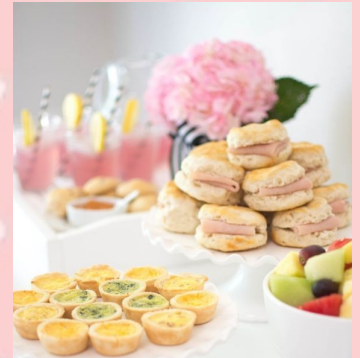
Mother's Day Breakfast