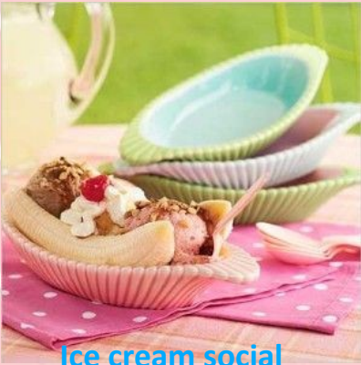
Ice cream social